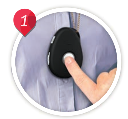
Whether you're at home or outdoors and need help, simply press the SOS button.