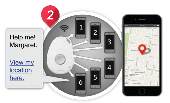
It then sends 6 help texts with your exact location via GPS and then calls those people consecutively.